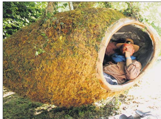
Taking a break in one of the interactive pods in the grounds of Bantry House.