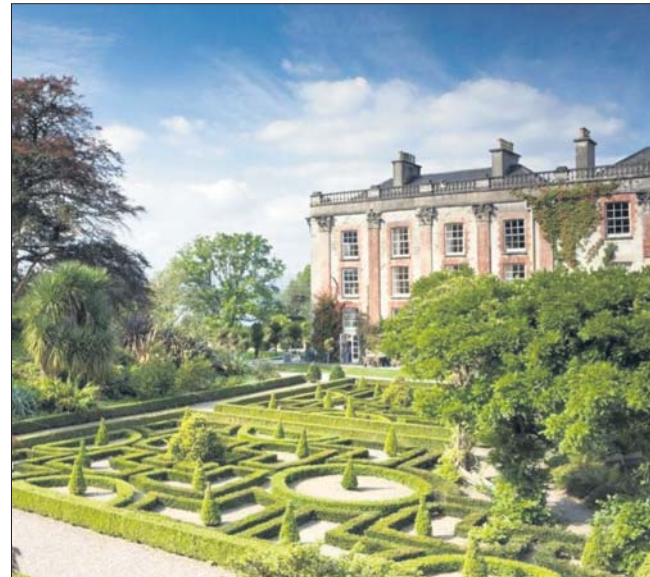
The grounds of Bantry House have been restored to their former glory.

A lot of work has gone into all of the house's component parts, especially returning the