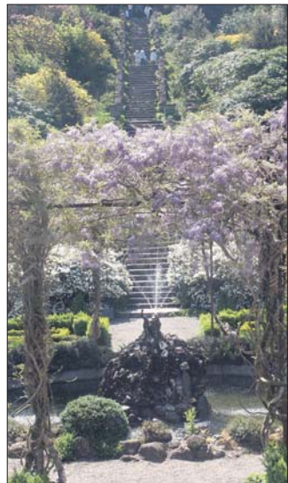
The wisteria is a noted attraction at Bantry House.

Too true: The exhibition only lasts until the end of November.